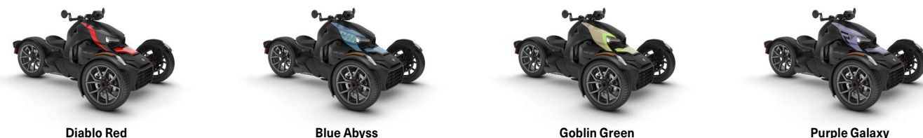
Diablo Red Blue Abyss Goblin Green Purple Galaxy