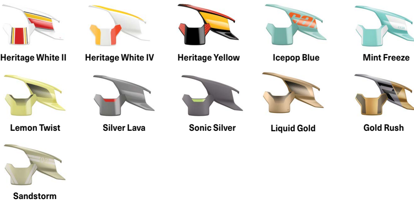
Heritage White II Heritage White IV Heritage Yellow Icepop Blue Mint Freeze Lemon Twist Silver Lava Sonic Silver Liquid Gold Gold Rush Sandstorm