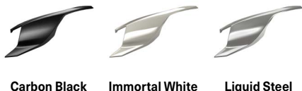
Carbon Black Immortal White Liquid Steel