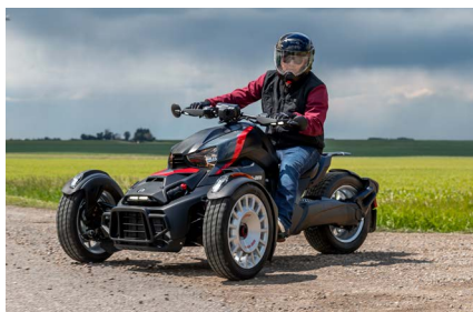
UNIQUE RALLY EXPERIENCE A vehicle designed for all-road trips with hand guards, rally comfort seat for a more reactive rider position, and adjustable large anti-slip foot pegs.