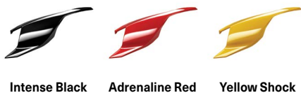
Intense Black Adrenaline Red Yellow Shock