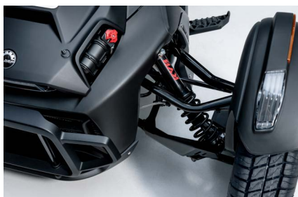
FULL KYB HPG SHOCKS Front and rear KYB HPG shocks with remote adjusters and 1 inch of extra suspension travel to optimise your ride and improve comfort.