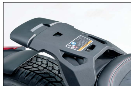
MAX MOUNT STRUCTURE Makes the unit 1+1 ready. It also increases the carrying capacity for different storage options.