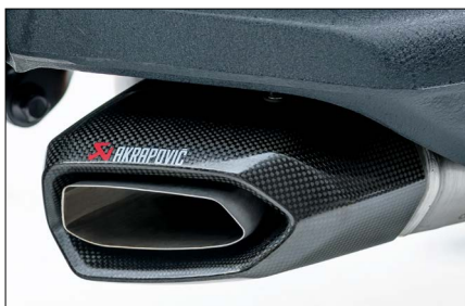
AKRAPOVIČ EXHAUST Unique sound signature and high-end exhaust.