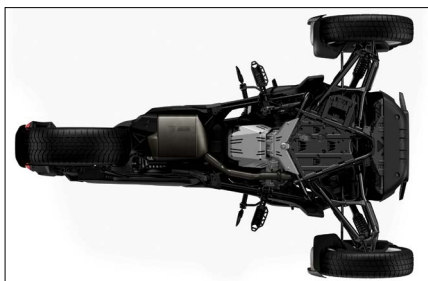
INCREASED VEHICLE PROTECTION Get extra protection for higher durability with front vehicle protection, aluminum skid plate under the vehicle, and reinforced rims.